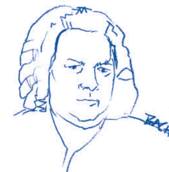
Johann Sebastian Bach, himself