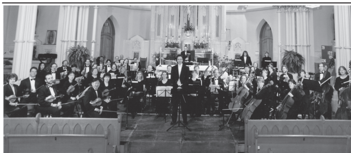
The Riverside Symphonia

For tickets and more information, contact BCCS at 215-598-6142 or www.buckschoral.org