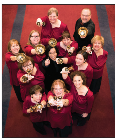
Philadelphia Bronze Handbell Ensemble

Our Lady of Mount Carmel Church, Doylestown